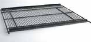
Product Stop Front and Rear

The Maslen Australia Four Post Shelving System, is simple, robust and effective