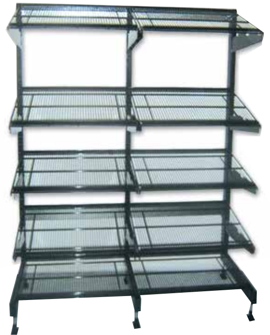
Cantilever Shelving System