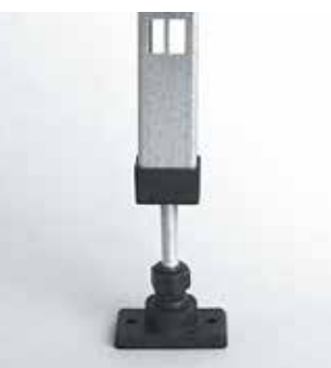
Adjustable Post Feet