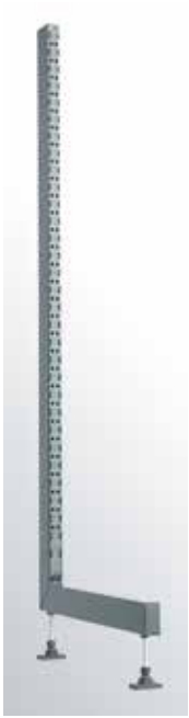
Cantilever Post & Feet

The Maslen Australia Cantilever Shelving System, is simple, robust and effective