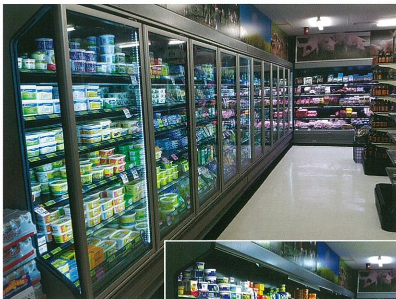
▲ Open Dairy Case AFTER glass doors fitted